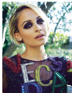
NICOLE RICHIE

The former wild child on why she's channelling her troublemaker past for a glamorous new cause Page 34