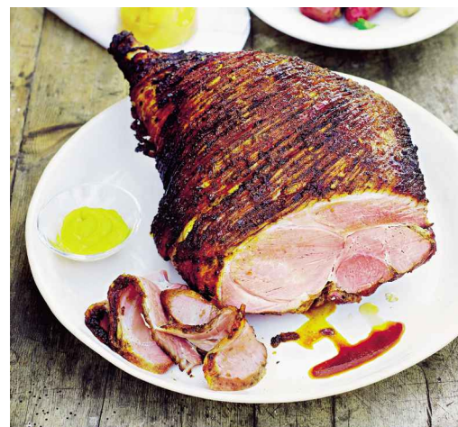
JAMIE OLIVER'S CHRISTMAS RECIPES PAGE 41